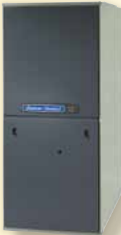
Gold ZM Freedom® 95 Comfort-R™ Variable-Speed

High quality and high efficiency mean a high standard of comfort for your home. The Gold Series offers just that. Whether you choose variable-speed technology, or a single-stage offering with the power to increase your overall system efficiency, you can be sure that each one contains American Standard's quality craftsmanship.