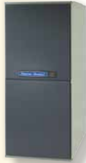
Gold XI High Efficiency Single-Stage