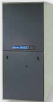
Silver ZI Freedom® 95 Single-Stage

Designed with value in mind, the Silver Series provides you with the comfort you want, the efficiency and durability you need and, of course, the American Standard commitment to quality you expect.