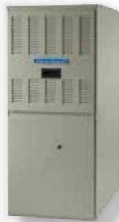
Silver SI American Standard 90