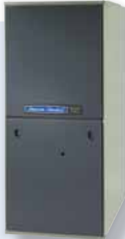
Platinum ZV Freedom® 95 Comfort-R™ Variable-Speed, Modulating, Communicating

Our most efficient and powerful gas furnace just might be our most comfortable too. With AccuLink™ communicating capability, continuous Comfort-R™ mode and an array of other innovative features, the Platinum Series gives your home maximum efficiency with controlled comfort.